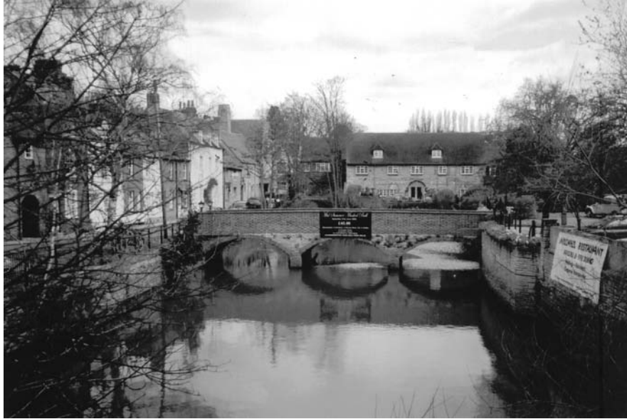
Fig. 4. View from Burford Bridge, looking east towards the site of the abbey mill. The few remaining buildings of the abbey, mainly administrative in purpose, can be seen beyond the left-hand arch of the bridge. This branch of the Thames is at the western end of Æthelwold's mill leat, c.960.

was the principal issue in the map-maker's mind. It is not mentioned in the voluminous papers accompanying various lawsuits which occurred in the sixteenth century.