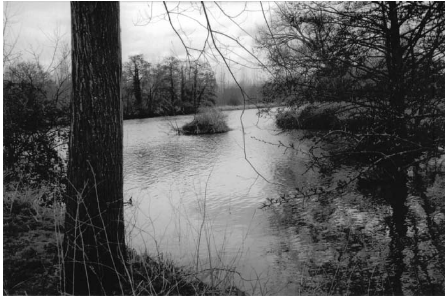
Fig. 3. The junction of the Swift ditch and the main course of the river Thames.

The meadows to the south of the southern course of the Thames are marked on the map as 'Swonye Mede' and 'Kytinye' [?] twice. One feature is conspicuous by its absence. There is no attempt to show the course of the Swift ditch as a navigable waterway. Thacker, writing in 1914, is clear that 'this now confined and grown-up channel was from the early middle ages the main navigation course of the Thames.' 27 (See Fig. 2.) A. E. Preston noticed this omission and in some manuscript notes for a lecture on the river at Abingdon made some useful comments. 28 He thought it strange that if the main navigable channel of the Thames at this date ran along the Swift ditch, it was not so shown. He commented, however, that the main purpose of the map was not to show the navigable channels, but to illustrate William Blacknall's various rights. However, if we take the map's evidence as correct, it would confirm that the navigable channel at that date followed the same course as at present (see Fig. 3).