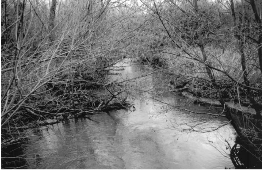
Fig. 2. The largely vegetation-choked course of the Swift ditch, the main navigation channel of the Thames before the eleventh century.

to two carpenters for mending the chapter weir; boards, cords, nails, gadnayl, and bordnayl cost 8s.9d. In the same year a new weir was built, and the large sum of £24 8s.6d. was paid to William Burford for its construction. 24 The outlay included cake-bread, beer, and also piles. It is of course possible that the weir mentioned was downriver at the abbey mills, where the Claydon map shows a similar construction.