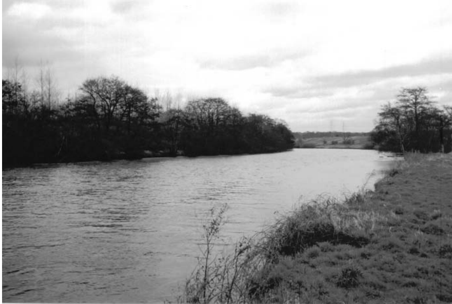
Fig. 5. The main channel of the river Thames south of Radley.