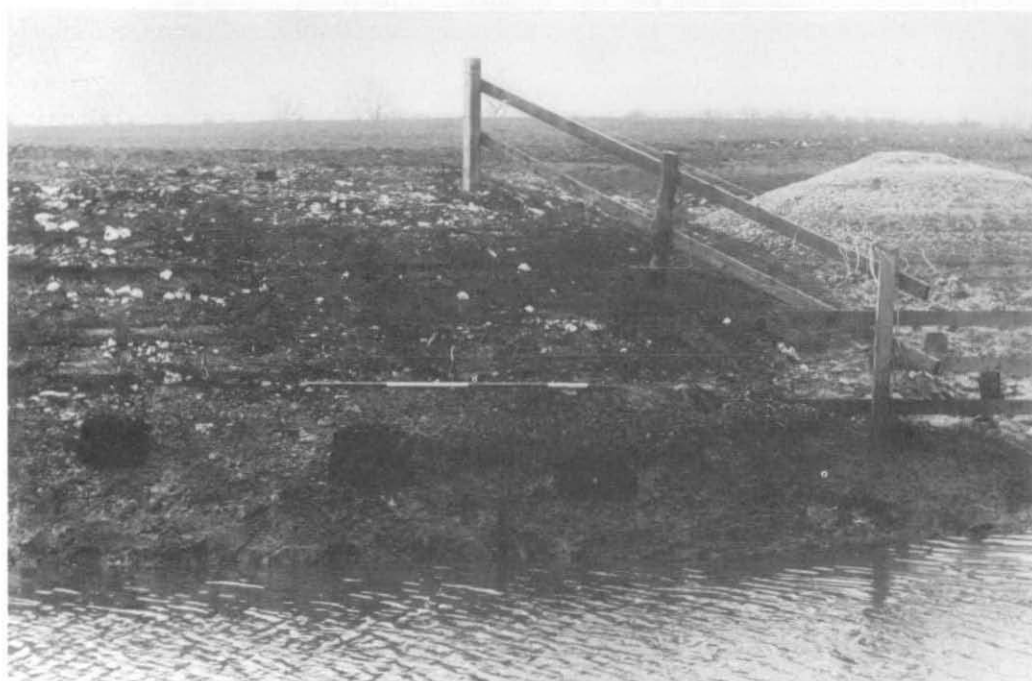
Plate 1. Roman Timber Bridge.

mature oak tree sawn approximately 0.4 m. square, similar to those dredged from the centre of the river. The piles were regularly spaced at 1.3–1.4 m. intervals giving an overall width of 4.1 m. between centres. To the west of the bridge a cattle wade had been cut into the river bank in more recent times. However, sufficient bank material remained undisturbed between the bridge and the cattle wade to ensure that traces of a fifth pile would have survived had one ever existed.