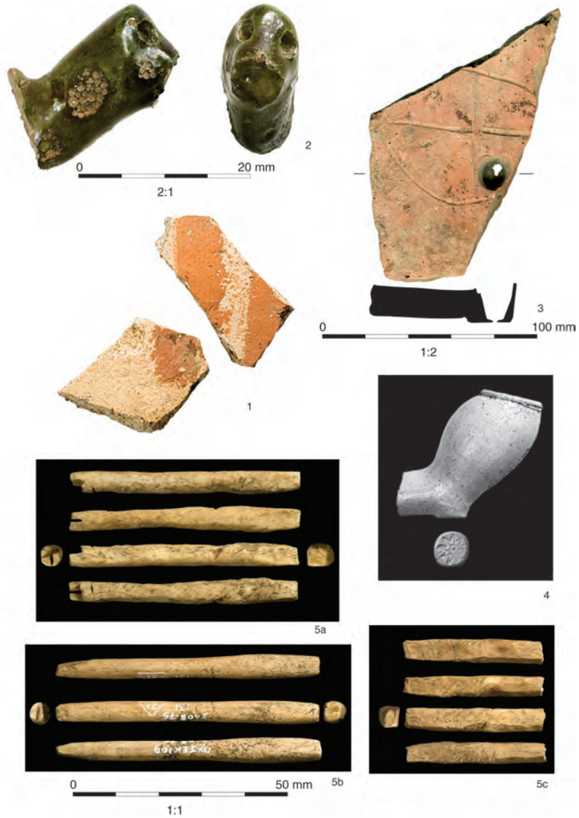
Fig. 6. Selected finds from excavations at Jesus College

to thirteenth-century pits 193 and 212 and from the charred timber deposit 156 within medieval hearth 157/153. The pieces are structural in character, probably deriving from oven structures rather than major buildings. The general characteristics of firing, thickness and size of wattles is typical of material generally interpreted as oven wall compared to wattle and daub walling, where larger split wattles or laths are more common. House daub is unlikely to have survived except in very severe house fires. Ovens would have continued to be built of clay reinforced with wattles until the later medieval period when brick started to replace more traditional methods of construction. A full report is available in the project archive.