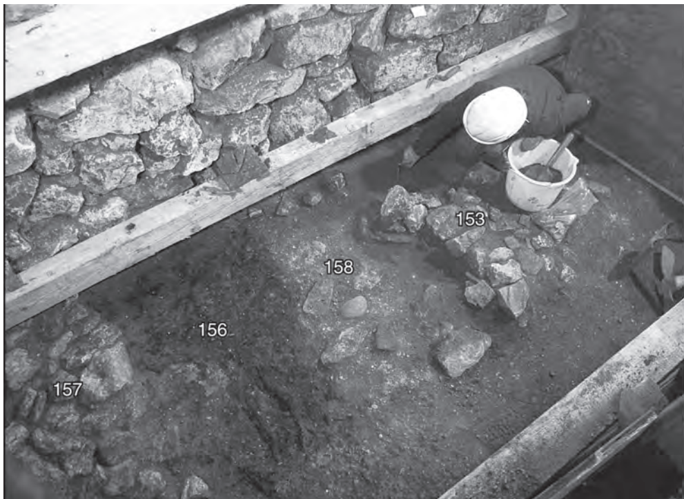
Fig. 4. Lift pit (Trench 2); later-medieval hearth, looking north-east. Contexts 153 and 157, stone spreads, overlay surface 158 and were separated by burnt timbers 156.

yellowish glaze that survived on numerous fragments. The occurrence of medieval roof tile in some early seventeenth-century contexts adds to the evidence that medieval buildings survived on the site until their demolition for the construction of new accommodation for Jesus College (see below).