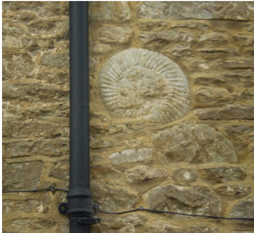
Fig. 1g. Upper Portland limestone: wall with ammonite, Great Haseley.