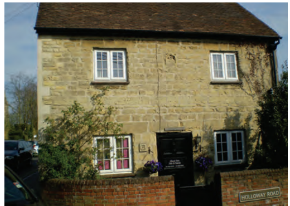
Fig. 1f. Wheatley Limestone (Corallian): cottage, Wheatley.