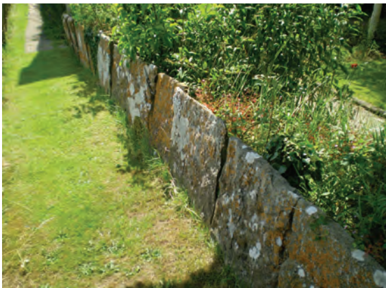
Fig. 1e. Forest Marble: flagstones used as fencing, Kelmscott.