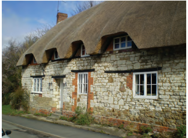
Fig. 1h. Chalk Stone: cottage, Ashbury.