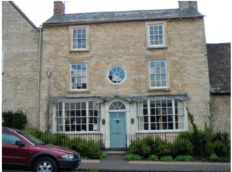
Fig. 1b. Chipping Norton Limestone: townhouse, Charlbury.