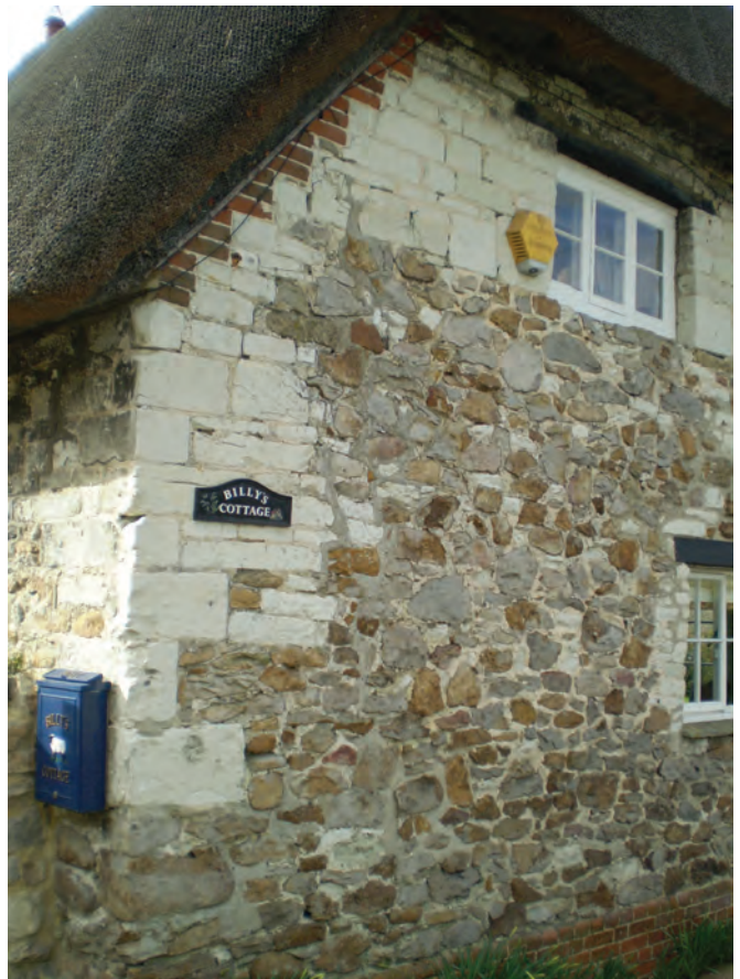
LEFT: Fig. 1j. Knapped flint: wall, Brightwell-cum-Sotwell.