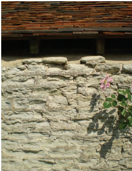
Fig. 1i. Chalk Clunch: barn wall, Mackney.