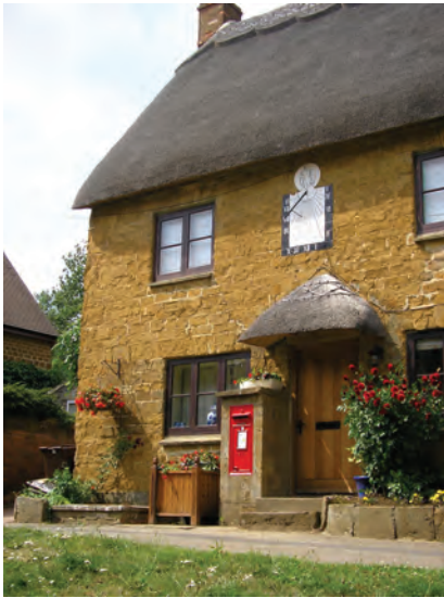
Fig. 1a. Marlstone: cottage, Wroxton.