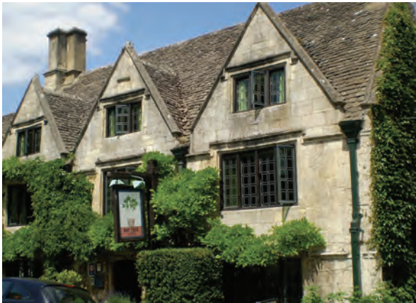
Fig. 1c. Taynton Stone walls and dressings, with stone-tiled roof: Bay Tree Hotel, Burford.