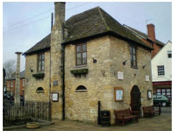
Fig. 1d. White Limestone: Market Hall, Eynsham.