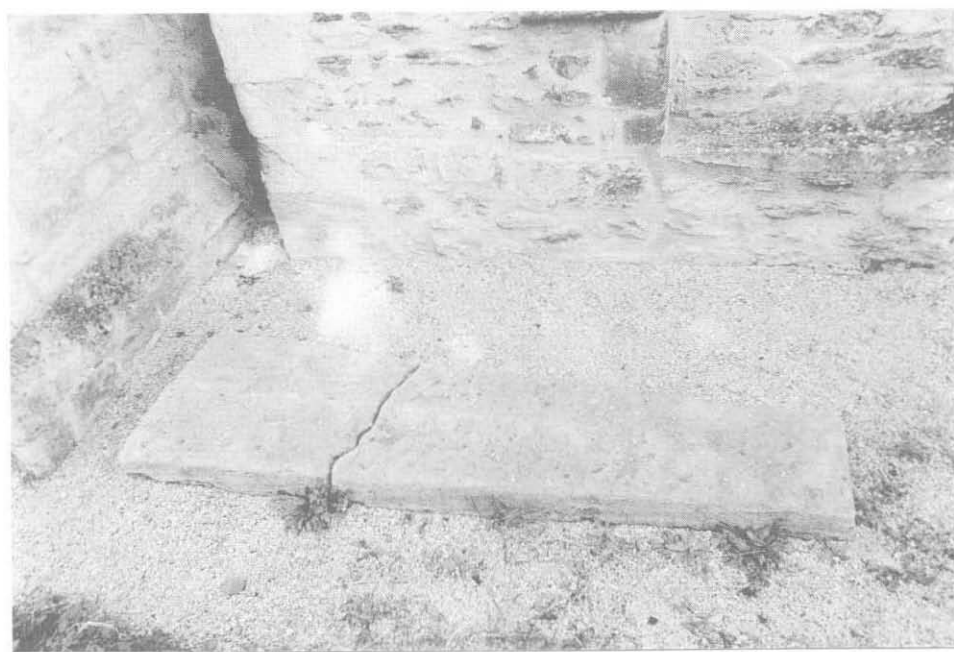
Fig. 4. 13th-century coffin lid lying to the south of the chancel, St. Mary the Virgin, Iffley.