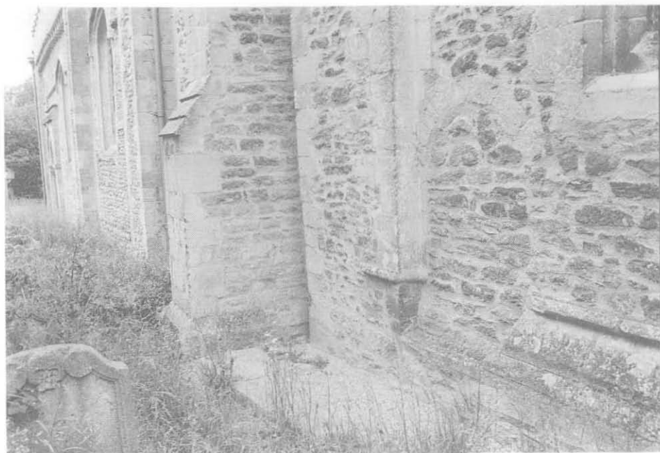
Fig. 3. Church of St. Mary the Virgin, Iffley, from the SE.