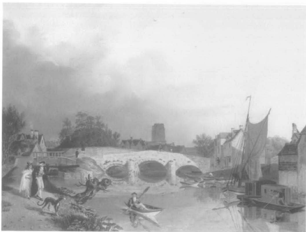
Fig. 1. Painting by Michael Angelo Rooker.

Rooker, born off Drury Lane the son of a pantomime actor and engraver, although a Londoner all his life, 3 may nevertheless be regarded as the father of modern Oxford townscapes, owing to his contribution to the Oxford Almanack over a period of twenty years. From 1769 to 1788, working in conjunction with his engraver father until 1776, he was responsible for the series of Almanack illustrations of Oxford buildings which so influenced later illustrators such as Turner. 4 The Almanack pictures highlight his love of detail and keen interest in very new buildings, as well as in those about to be demolished: he painted several versions in oil of the rebuilding of South Bridge at the time of the demolition of Friar Bacon's Study in 1779, one of which was also exhibited at the Royal Academy in the same year. 5 Already active as an artist as a very young man in the 1760s, he served an apprenticeship under Paul Sandby, joined the Royal Academy as a student in 1768 and hoped to become a painter of landscapes in oils, but fame and