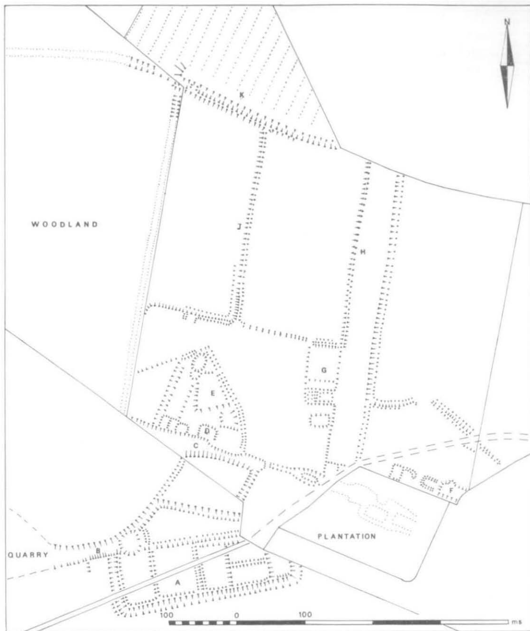
FIG. 2 Earthwork plan.